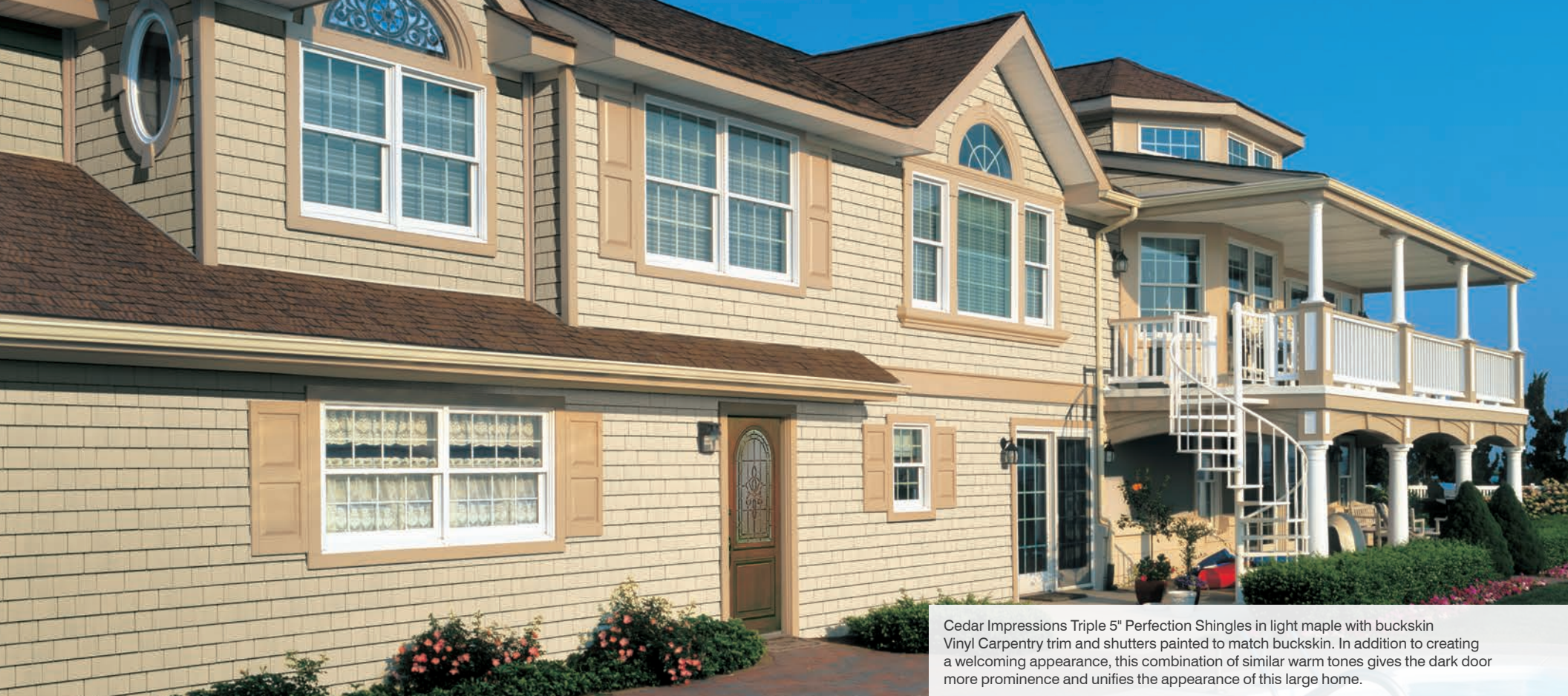
Cedar Impressions Triple 5" Perfection Shingles in light maple with buckskin Vinyl Carpentry trim and shutters painted to match buckskin. In addition to creating a welcoming appearance, this combination of similar warm tones gives the dark door more prominence and unifies the appearance of this large home.